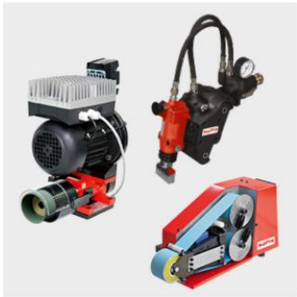
Supfina SUPERFINISHES machines for surface treatment