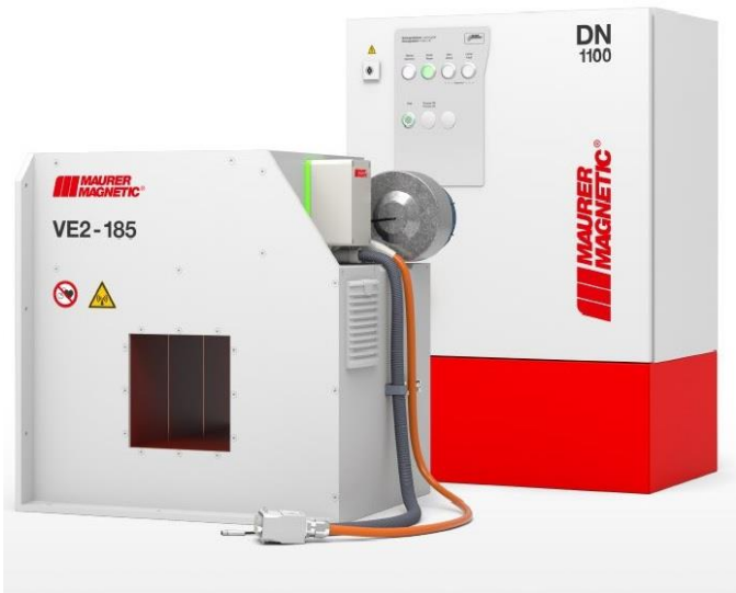
Demagnetization of parts