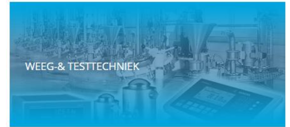
Weighing and testing technology