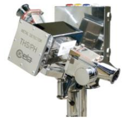
Metal detection machines