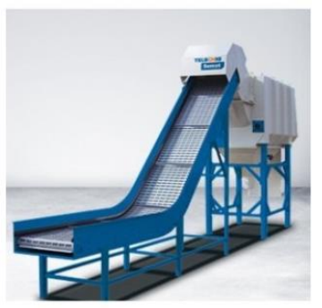
automatically open bags systems