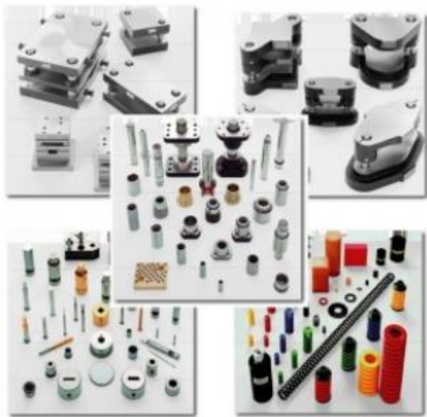
Standard parts for stamp construction and mould construction