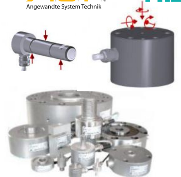
Force transducers, force/torque sensor and measuring pins