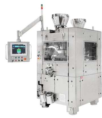
Tablet or capsule press