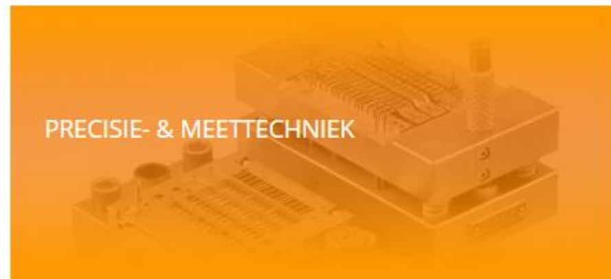
Precision and measurement technology