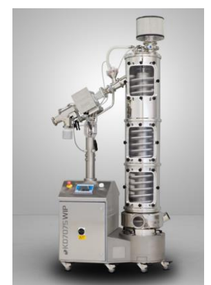
Dedusters and capsule polisher