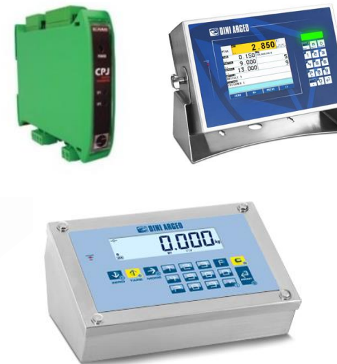
Force amplifiers and weighing amplifiers