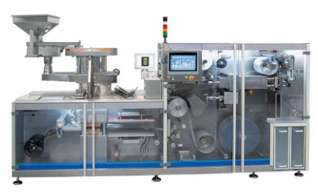
Packaging and cartoning lines