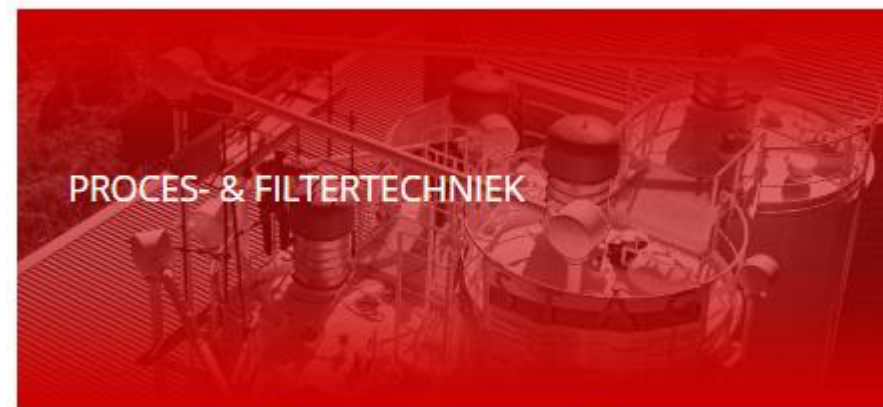
Filter, process and packaging technology