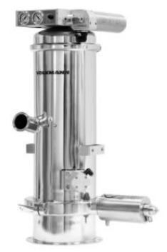
Vacuum Conveyors transport