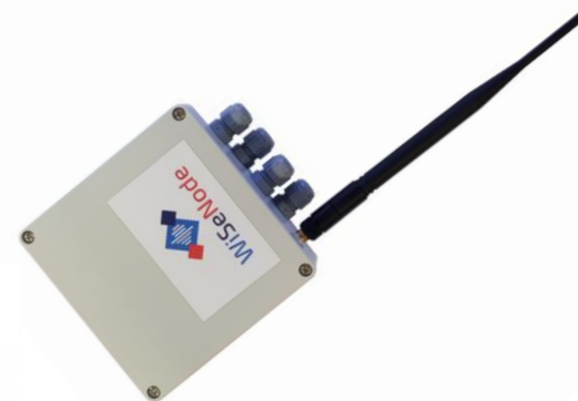
Wireless measurements systems