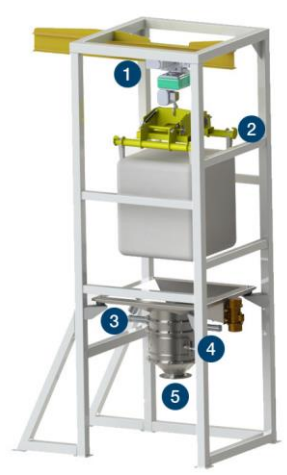
Bulk Bag Unloading Stations