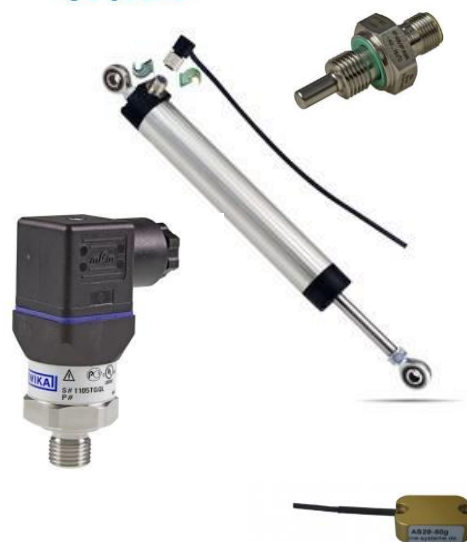
Displacement, pressure temperature and acceleration sensors