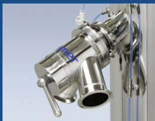
Option: Product Diverter KV2010