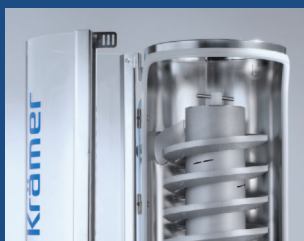
Pivoting and fully removable Window