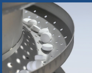
Option: Various helix surfaces available on request